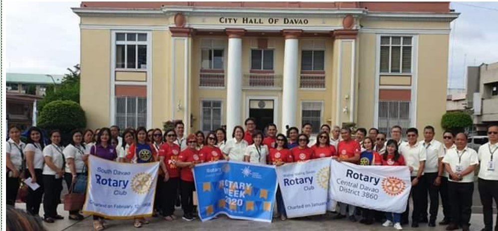
Attended Flag ceremony & Courtesy call at Davao City Hall. Feb. 17, 2020.