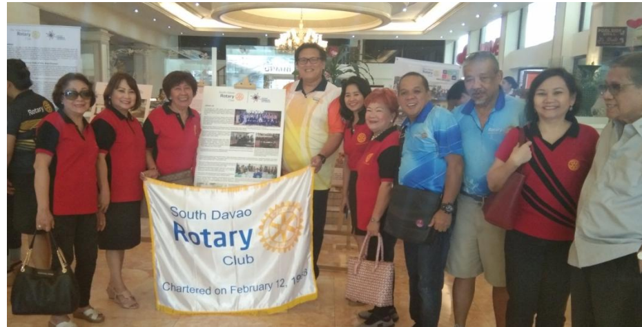
Opening of Rotary Window at Grand Men Seng Hotel.